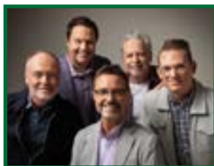
Special musical guests: Legacy Five

Enjoy a delicious meal with friends, and tap your feet to inspirational Christian music.