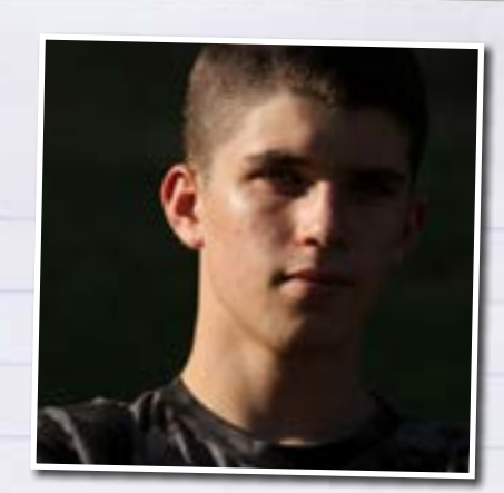
Is it okay if I want to be adopted, does it mean I love my mom and dad any less?

Celebrating with a 17-year-old as his adoption day is nearing after years of uncertainty with residential and family placements. The right match seemingly elusive until it finally comes together. Working through the complicated web of emotions that comes with connecting to biological parents and siblings while looking forward to a future adulthood with new, stable and forever support.