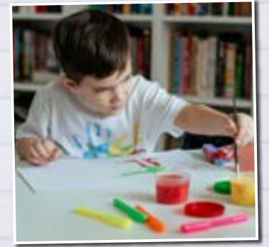
Will I ever get to go home? Celebrating Christmas with a child who is living in congregant care and literally has no one else in the world.