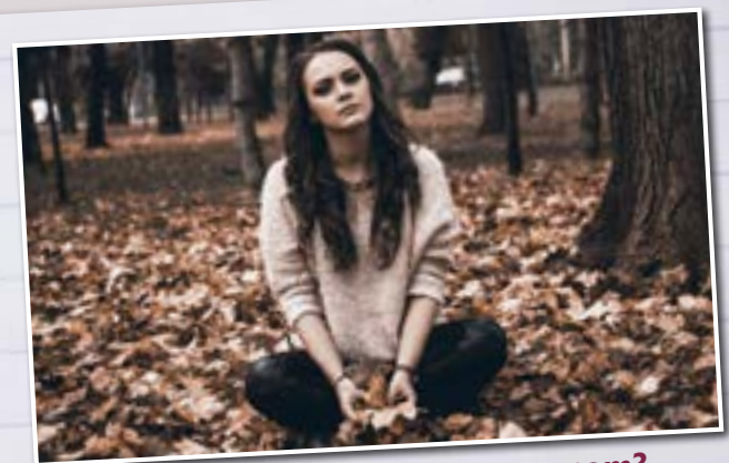
When will I get to go home to my mom? Guiding a child for years and through multiple rounds of preparation services, making sure her unique needs can best be met by any potential, permanent resource, being that child's advocate.