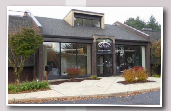
COBYS purchases 444 Murry Hill Center to house Foster Care, Adoption and Family Life Education staff

COBYS purchases 171 E. King Street to host growing Family Life Education programs