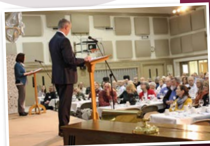
2020 Annual Banquet

Financial Support. COBYS Family Services remains on strong financial footing. While there have been decreases in individual and group donations through private giving over the last two years, we have also been blessed by substantial bequests. These and past planned gifts, managed wisely over time along with our yearly donations, have provided the organization with the resources it needs to operate, even in uncertain times. Throughout the year, we actively engage with new and long-time donors and are continually in awe of their generosity for the individuals, children and families we serve.