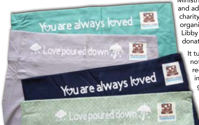
Left: Inspirational phrases added by Libby to each pillow case.

Libby makes a great case for sharing pillows.