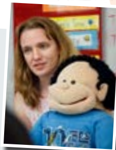
Dina small group therapy

Counseling. Eight part-time therapists provided 6,012 hours of therapy at three centers during the year, including 1,195 hours of service through Dina group therapy provided to children ages 4-8 with behavioral challenges in eight groups held throughout the region. Clinical services are offered at the Oregon Counseling Center, the Palmyra Area Counseling Center and at the COBYS Family Life Center in Lancaster City.