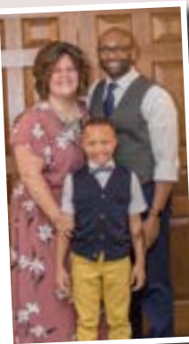
COBYS has facilitated the adoptions of 542 children and counting.

affiliate of the Statewide Adoption & Permanency Network (SWAN). Services include child specific recruitment to help locate adoptive homes for children, child preparation to ready children for transitions, child and family profiles to facilitate matching, finalizations, and post adoption support. The level of services provided by the