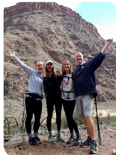
The Cunninghams on their recent “hiking” vacation.