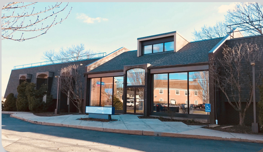
Murry Hill Center, the new COBYS facility, is located at 444 Murry Hill Circle, Lancaster, and houses adoption, foster care, and family life education staff.

After many months of crowded quarters, COBYS Family Services has room to grow.